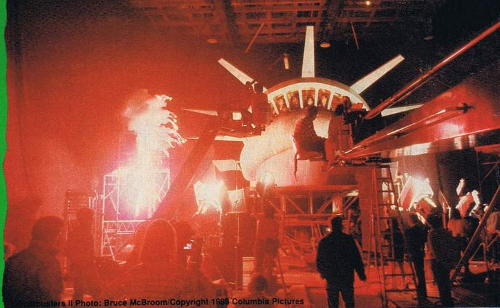
Ghostbusters II

Aykroyd isn't against donning proton packs with Harold Ramis and Bill Murray for a potential third Ghostbusters .