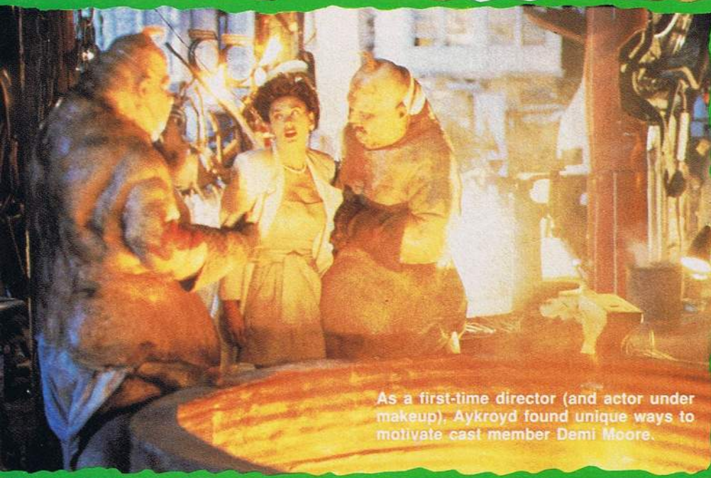
As a first-time director (and actor under makeup), Aykroyd found unique ways to motivate cast member Demi Moore.

skills. And while Aykroyd in prosthetics didn't prove to be a distraction, the actor/director concedes that he did feel more than the slightest bit embarrassed bellowing out orders in makeup.