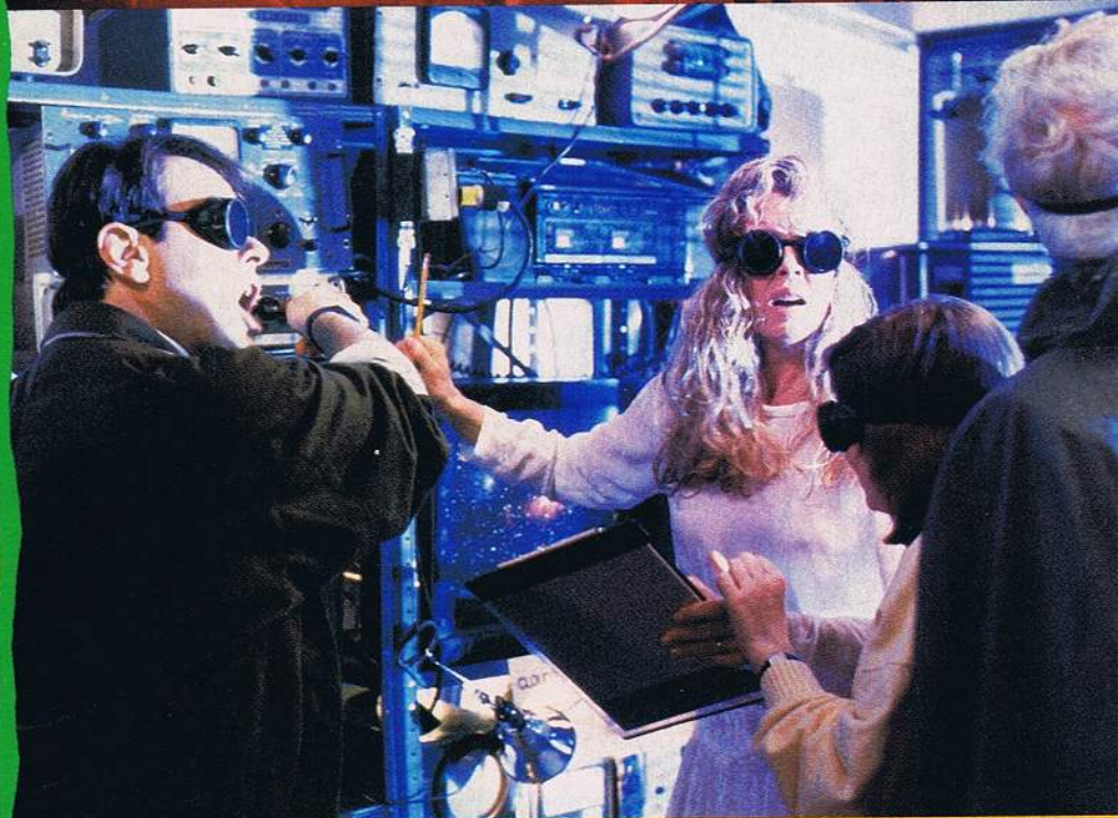
The actor enjoyed working alongside Kim Basinger, but didn't like the fact that My Stepmother Is an Alien had to go up against Schwarzenegger.