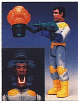
Winston Zeddemore™ with Scream Roller™ and Spud Thud™