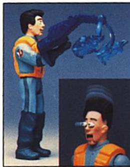
Peter Venkman™ with Gruesome Twosome™ and Hook Shot™