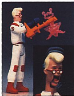
Egon Spengler™ with Soar Throat™ and Terror Tweezer™