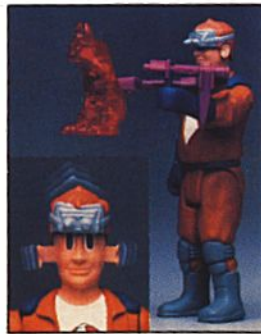
Ray Stantz™ with Jail Jaw™ and Fork Lift™