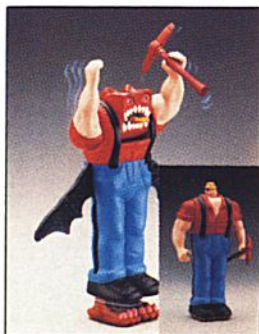
Hard Hat Horror™