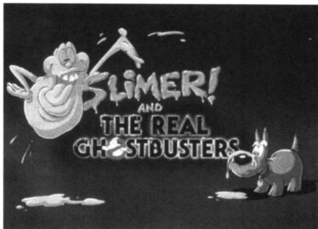
Title card from the popular ABC Saturday-morning series Slimer! and the Real Ghostbusters.