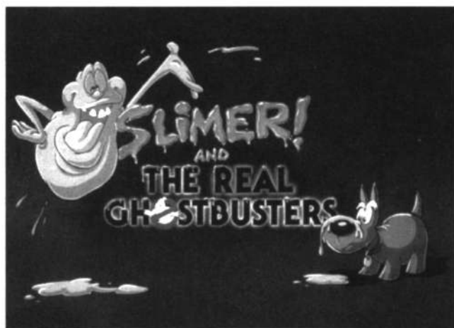
Title card from the popular ABC Saturday morning series, Slimer! and the Real Ghostbusters.

Arsenio Hall and Lorenzo Music (the voice of Garfield the Cat) in the previous Saturday-morning series, was now voiced by Dave Coulier. ABC renewed the series for the 1989–90 season and the program was reduced to a half hour, divided into two 15-minute adventures each week. Among the season's broadcasts was the premiere of the prime-time Halloween special Slimer! And The Real Ghostbusters: The Halloween Door . ABC canceled the series after four seasons. It was later rebroadcast on USA Network's Cartoon Express .