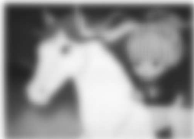
1989-1990: When Brite was first introduced, she was a colorful character who was known for her bright, colorful mane and tail. She was a popular character on the show, and her adventures were often filled with fun and excitement. The show was a hit, and Brite became a beloved character among children.

1994-1995: In the fourth season, Brite's adventures continued, and she was joined by a new character, a small, round, red creature named Red. The show was a success, and Brite's popularity grew.